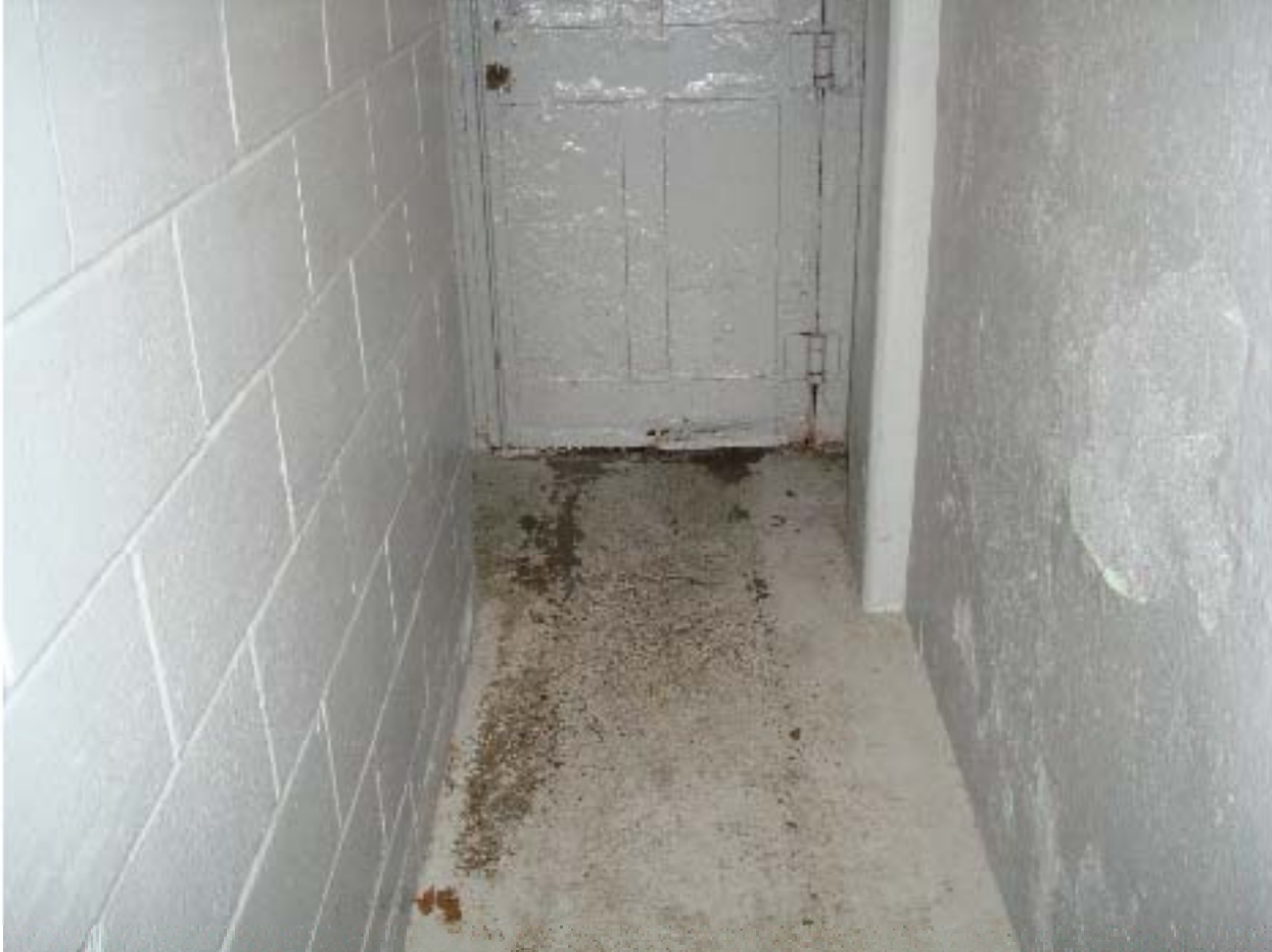
Flooding and water damage in a hallway.