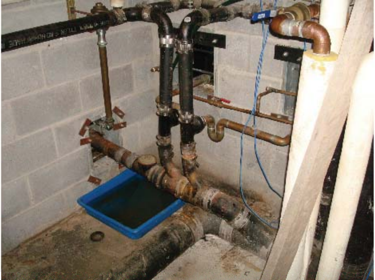
Aged, rusting, and leaking pipes