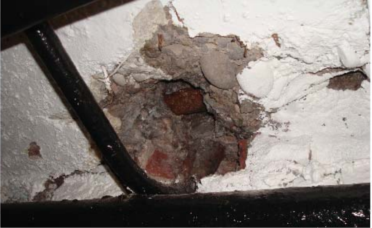
The ceiling is crumbling due to water damage.