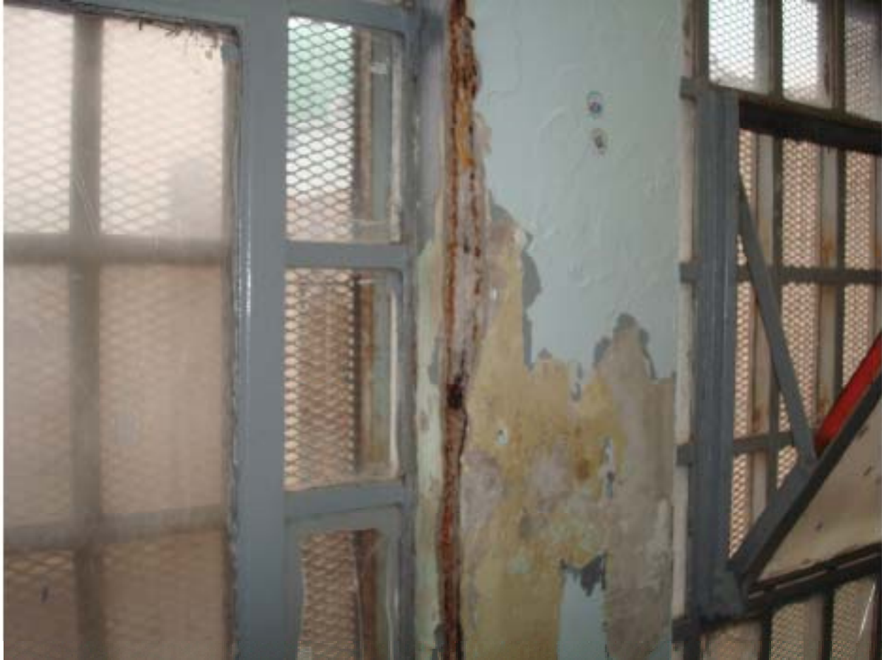
Crumbling wall adjacent to windows of a cellblock.