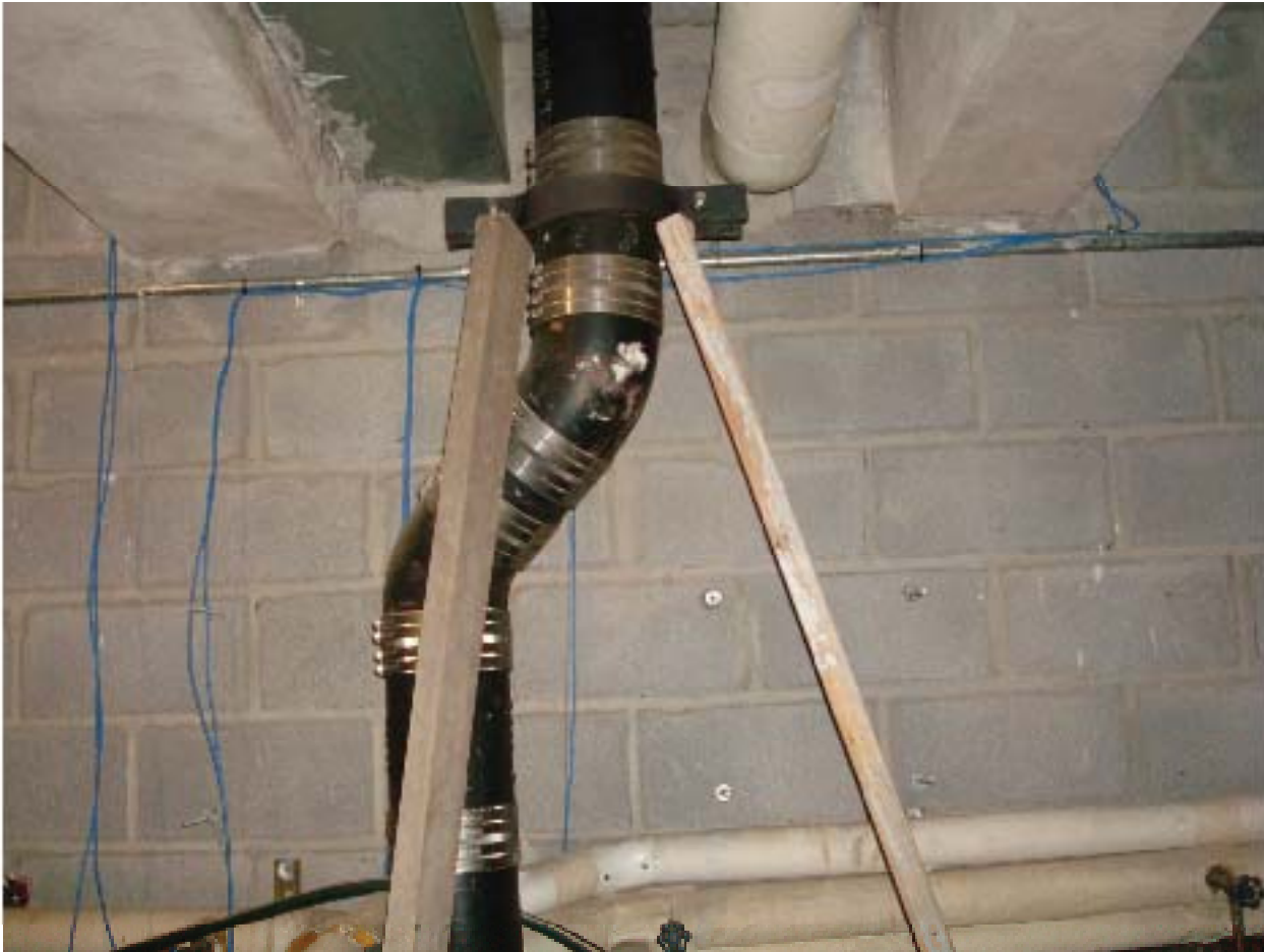
Repairs to these pipes were held together by pieces of wood.