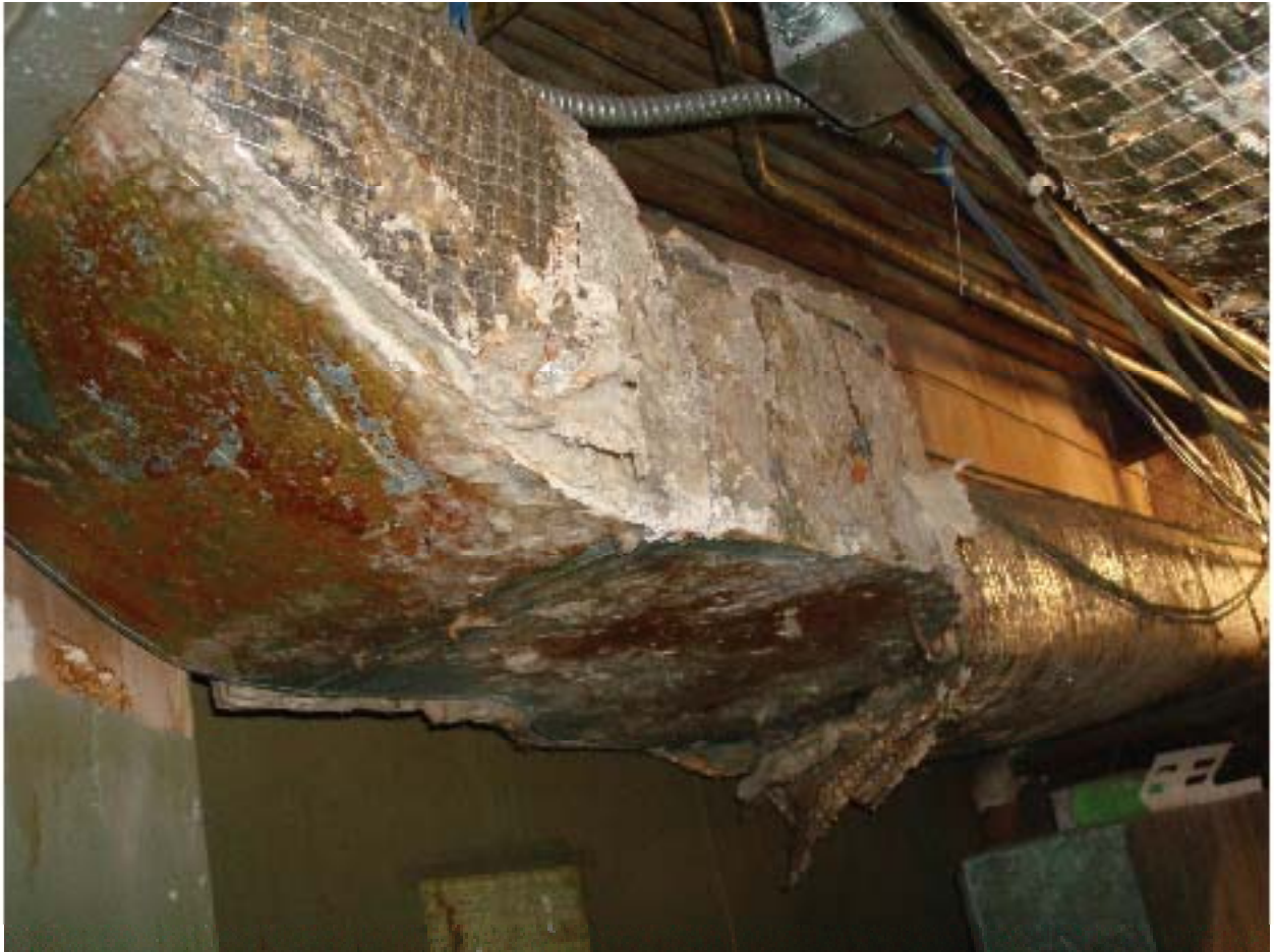
Rusting, decaying air ducts.