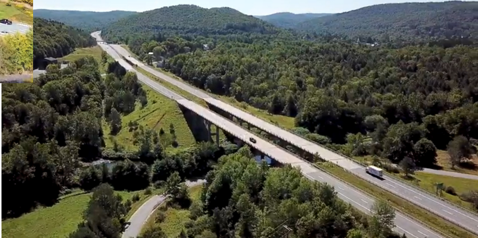
Clockwise from top left: the Roebing Bridge in Barryville, the ballroom of the Hurleyville Performing Arts Center, the Tusten Theater in Narrowsburg, Route 17 crossing the Willowemoc near Livingston Manor, the Care Center at Sunset Lake in Liberty, and a Sullivan Renaissance garden in Livingston Manor.