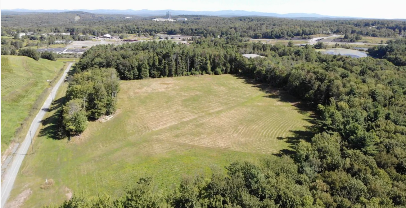
This northward view of the proposed industrial park property in Monticello shows the now-closed County Landfill on the left, the former Apollo Mall just beyond, the Catskill Mountains and Resorts World Catskills casino in the distance, and Route 17's Exit 106 interchange at upper right.