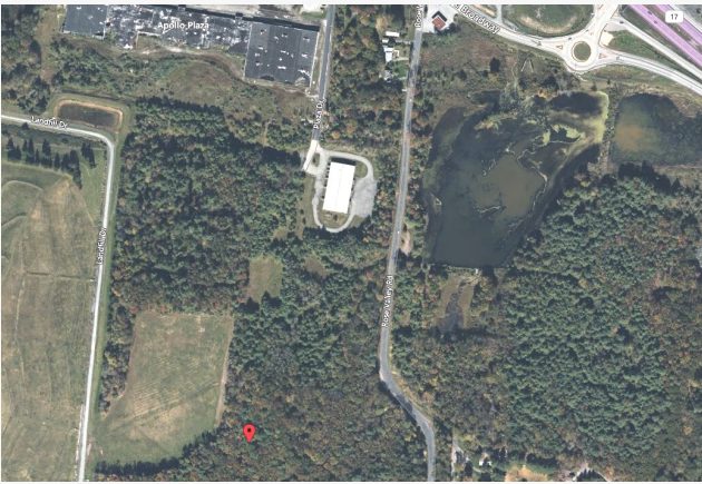
The red pin marks the purchased property site.

property and had an option on expanding next door. The sale means they now have up to five developable portions of the property for light industry (like warehouses, distribution facilities and small manufacturers) - AND they'll be paying property taxes, unlike our tax-exempt ownership. Located right off Route 17's Exit 106, it's a prime piece of land that holds the promise of increasing jobs and tax revenue for the Village of Monticello, the Town of Thompson and Sullivan County.