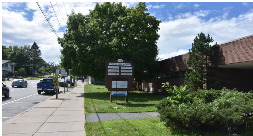
The Medical Arts Building in Monticello, better known as 518 Broadway, has been purchased by Sullivan County for the Board of Elections' relocated offices.