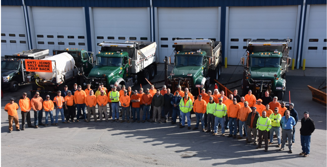
The Road Maintenance crew of Sullivan County's Division of Public Works has spent weeks thoroughly preparing for winter's blast. The hardworking team includes personnel from the Bridge Department, Sign Shop, Mechanics and Welders.

Departmental Spotlight: The Sullivan County Division of Public Works' Road Maintenance Crew