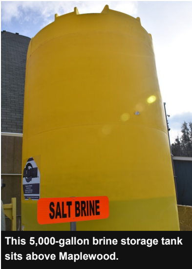
This 5,000-gallon brine storage tank sits above Maplewood.

Several County routes are pre-wet in a different fashion (but at similar cost savings). Two brine trucks carry 1,000 gallons apiece to apply to the roadway 24 hours before a storm hits, preventing snow and ice from bonding to pavement.