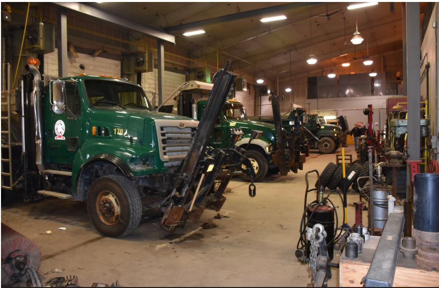
Dump trucks are being refitted with plows and sanding equipment at Maplewood.