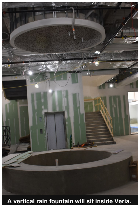
A vertical rain fountain will sit inside Veria.