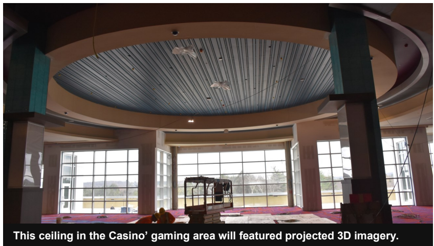
This ceiling in the Casino' gaming area will featured projected 3D imagery.

Thanks to the accommodation of the respective developers, County officials had a chance recently to get a sneak peek of both the Resorts World Catskills Casino and the Veria/YO1 health resorts now under construction in Monticello!