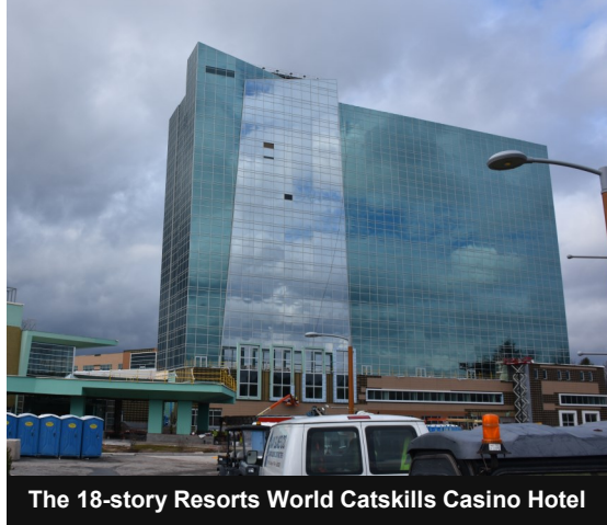
The 18-story Resorts World Catskills Casino Hotel

Thanks to the accommodation of the respective developers, County officials had a chance recently to get a sneak peek of both the Resorts World Catskills Casino and the Veria/YO1 health resorts now under construction in Monticello!