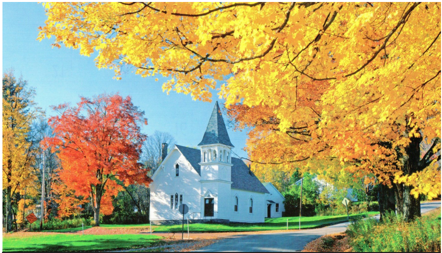
Sullivan County's Plans & Progress Small Grant Program helped the historic Cochection Center Community Center complete its much-needed roof replacement.

Pleased to hear the Governor will dedicate $225 million in matching funds to shared-services efforts, Potosek testified via letter that New York State "must join with us in reducing the tax burden on our tapped-out residents. We alone cannot do it."