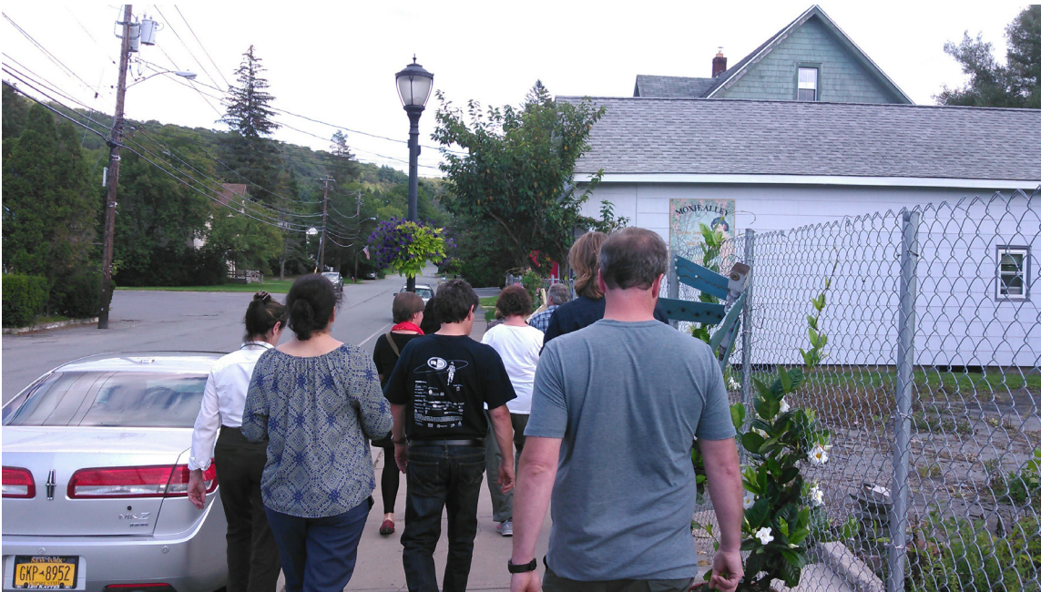
The Steering Committee walks along Pearl Street in Livingston Manor

Prior to this property owners meeting a letter was mailed out to owners along the potential trail route shortly after the 2017 July 4th holiday. The letter contained important information such as an overview of the trail project and contact information in case they wanted to learn more and express support or concern for the project.