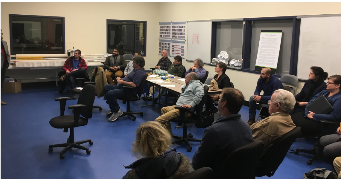
Stakeholders and Property Owners meet at the Hurleyville Makers Lab in November of 2017.