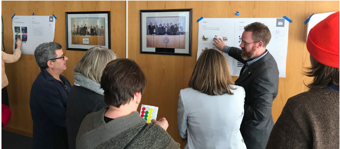
The project team discusses potential trail design and branding with the steering committee and stakeholders.