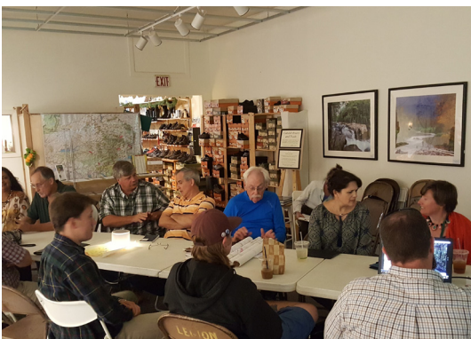
The Advisory Committee discusses the future of the Sullivan O&W Rail Trail

An advisory committee, composed of key stakeholders and County officials, was formed and brought together for a series of meetings and calls beginning in August of 2017. An inventory and analysis of existing conditions was assembled through field inventory, desktop analysis, and research. Using this information to start the conversation, the advisory committee helped inform the consultant team and guide the planning effort in the following key areas.