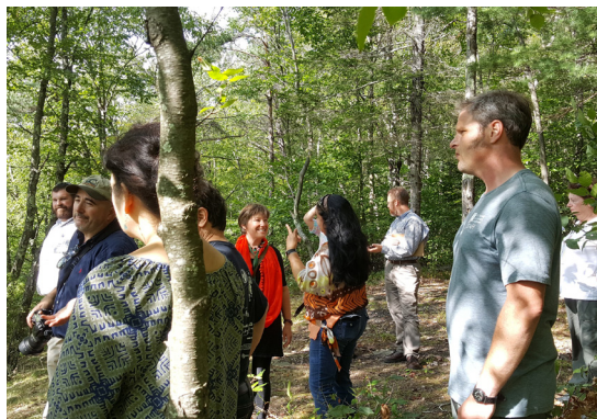
The Advisory Committee walks a portion of the undeveloped rail trail

Safety Roadway safety, especially crossings, were made a priority for the trail design.