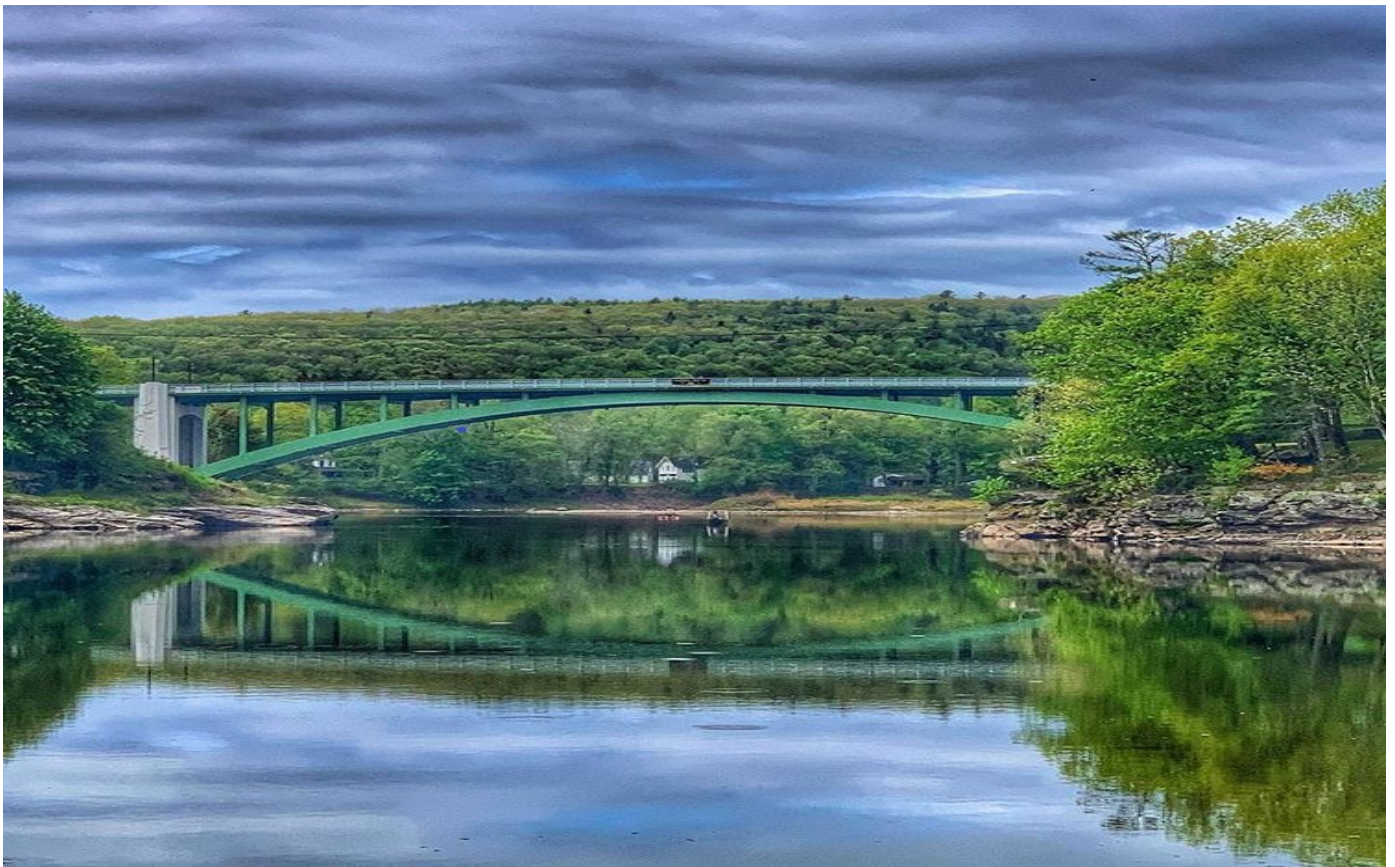
Landers River Trips