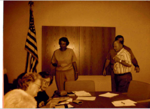
One of our many council meetings over the years

Cornell Cooperative Extension Dutchess County Ulster County Sullivan County Orange County