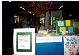
Volunteers helping our community be smart with their money!