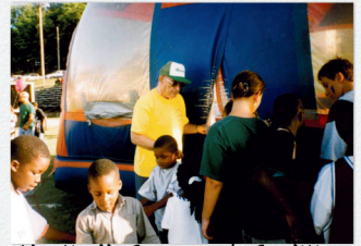
Monticello Crossroads Coalition Annual Block Party