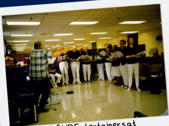
RSVP Entertainers at Walnut Mountain Nursing Home