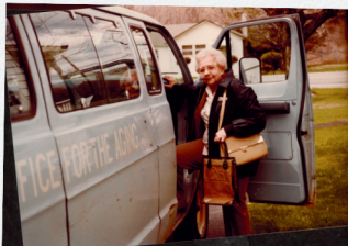
Take a ride on the OFA Van!