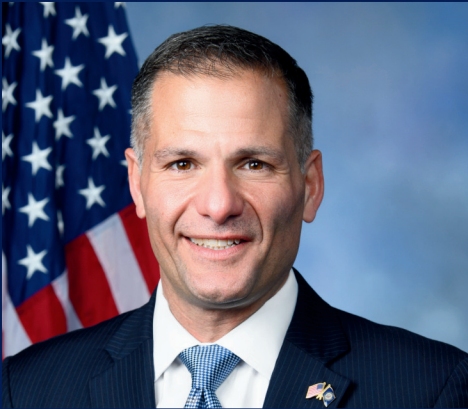
NEW YORK STATE CONGRESSMAN Marc Molinaro

Thank you to our representatives for their continued dedication to Sullivan County and our senior volunteers!