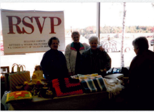
Fifth Annual Apollo Plaza Community Fair Saturday, October 5, 1996