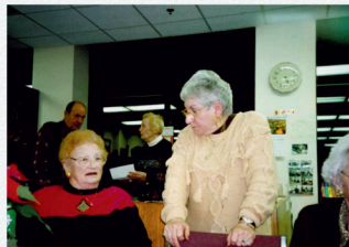
Fallsburg Reading Center