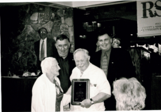
Congratulations to all our beloved volunteers!