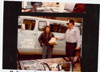
Delivering hot meals since 1973!