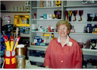
Community General Hospital Gift Shop