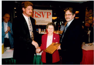
May 1997 Recognition Day Luncheon