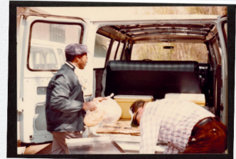
Meals on Wheels ready to go!