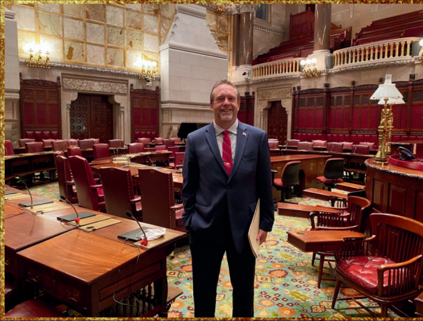
NEW YORK STATE SENATOR Peter Oberacker