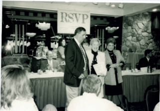
RSVP Luncheons are tradition!