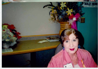
Community General Hospital Information Desk