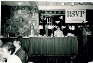
Time to celebrate!