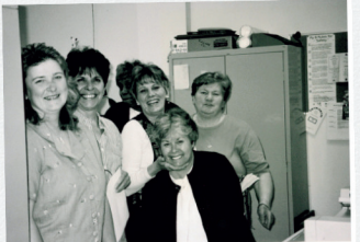
Smile for the camera!