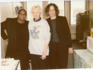
Many great memories together