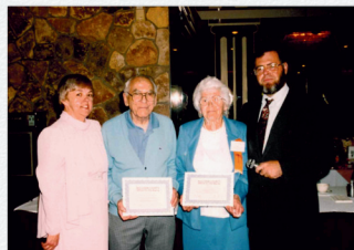
20th Anniversary RSVP Recognition Day Luncheon