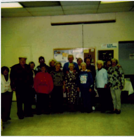
Nutrition Volunteer Thank You Dinner October 24, 1996