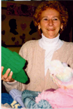
George L. Cooke School Accepting hats & gloves for school children